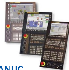
FANUC Industrial Computer

Contact the services team at gssteam@wernerelectric.com or at 920-815-4056